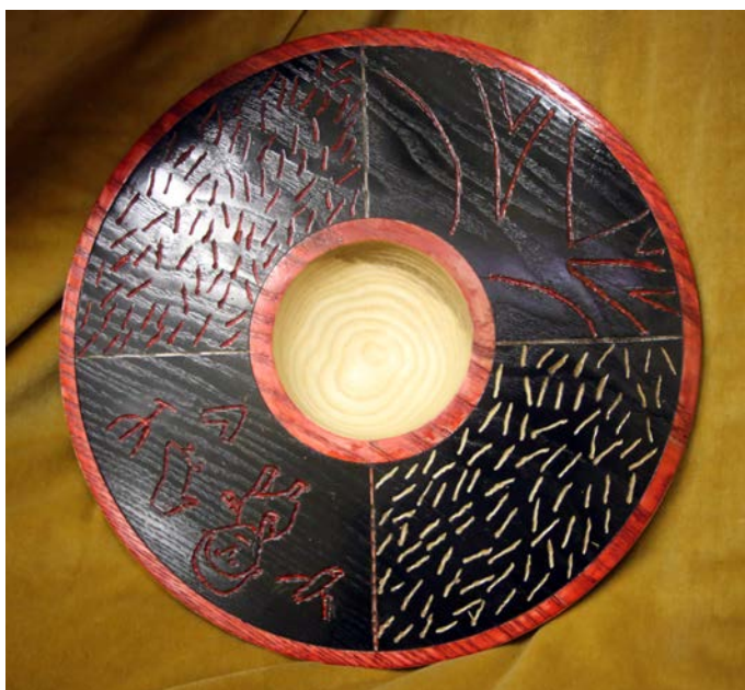
2nd Patsy Cassidy