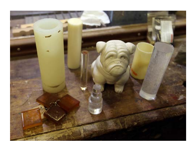
there is no need to spend lots of money to

When talking about the actual casting process Ryan explained that the two methods used to remove bubbles in the resin are with a vacuum pot and pressure pot. A vacuum will extract bubbles and a pressure pot will compress them until they are invisible to the naked eye. For small casting of, say, pen blanks it is possible to use a hair drier or heat gun to burst the bubbles on the surface of the resin so