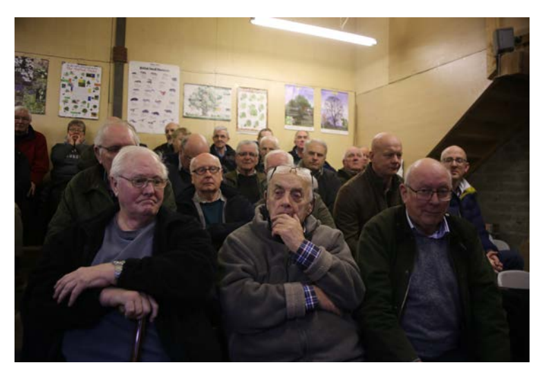
Our wonderful audience