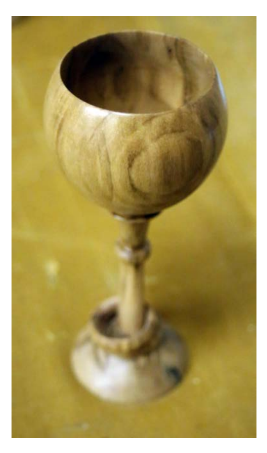
2nd Patsy Cassidy