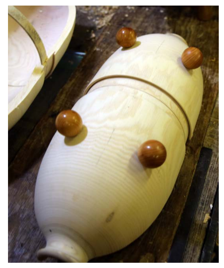
He had Blue Peter ball feet with him that he showed us how to fit. He also had a dish with him that he had fitted legs onto. It looked very well also.