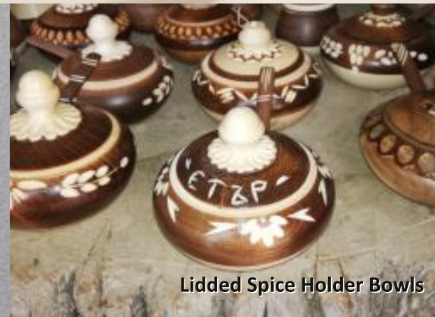
Lidded Spice Holder Bowls