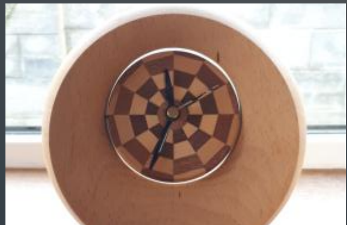
An off centre swivel clock