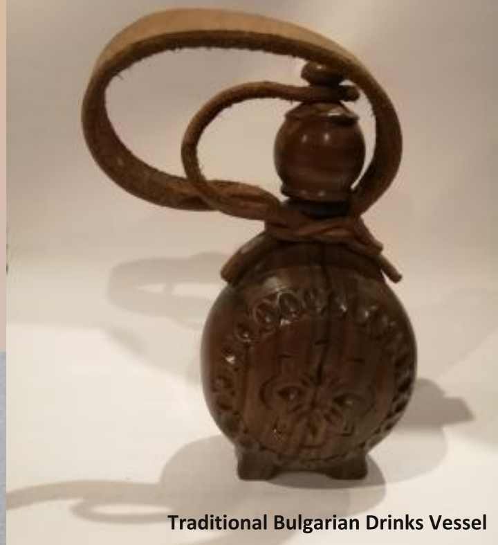
Traditional Bulgarian Drinks Vessel