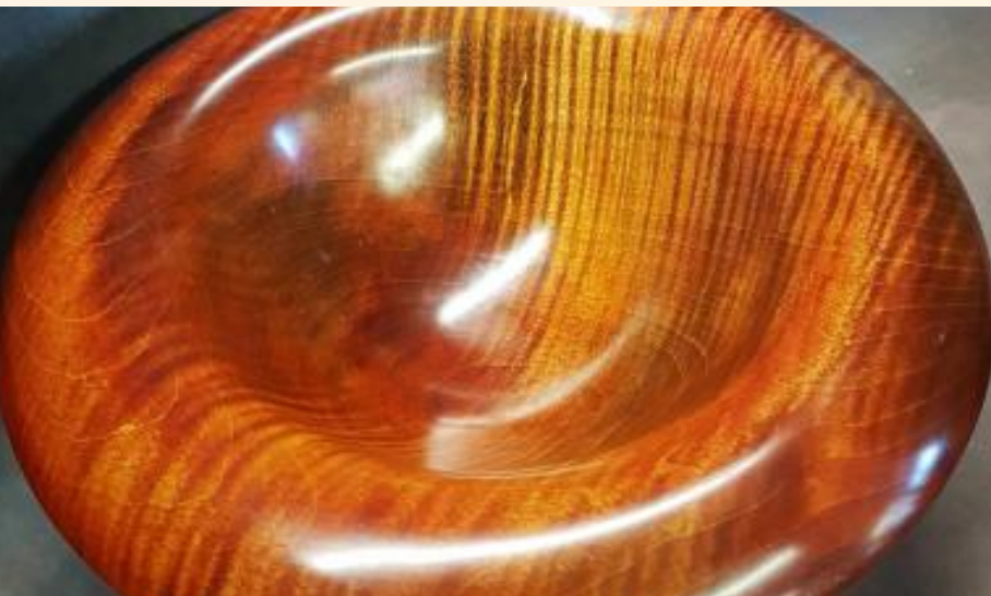
Atmosphere Colouring Using Waterbased Dyes