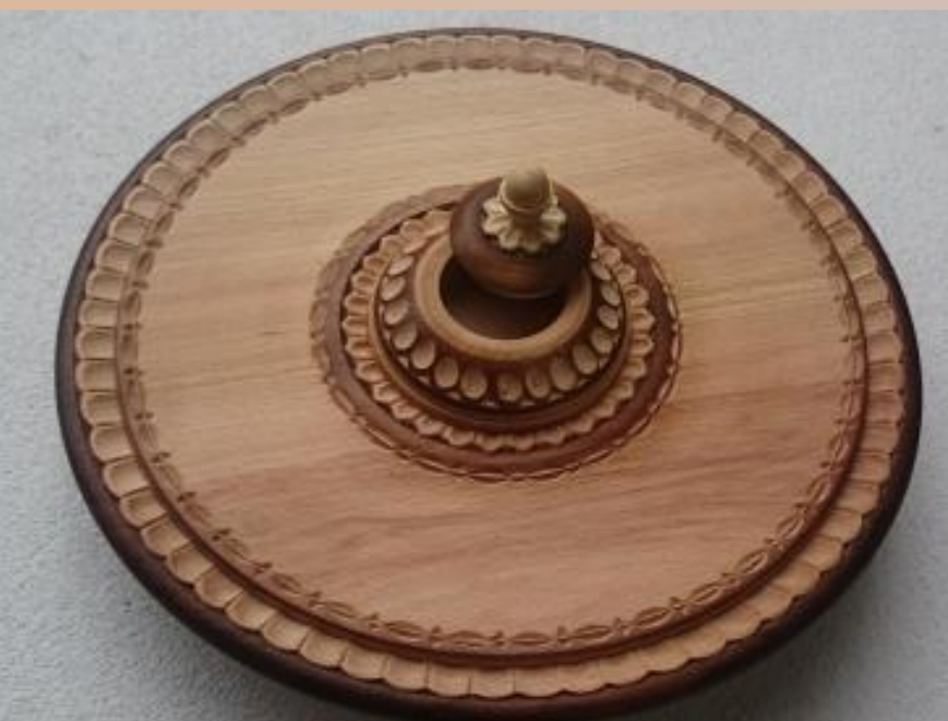
Lazy Susan Serving Platter with Lidded Salt Holder