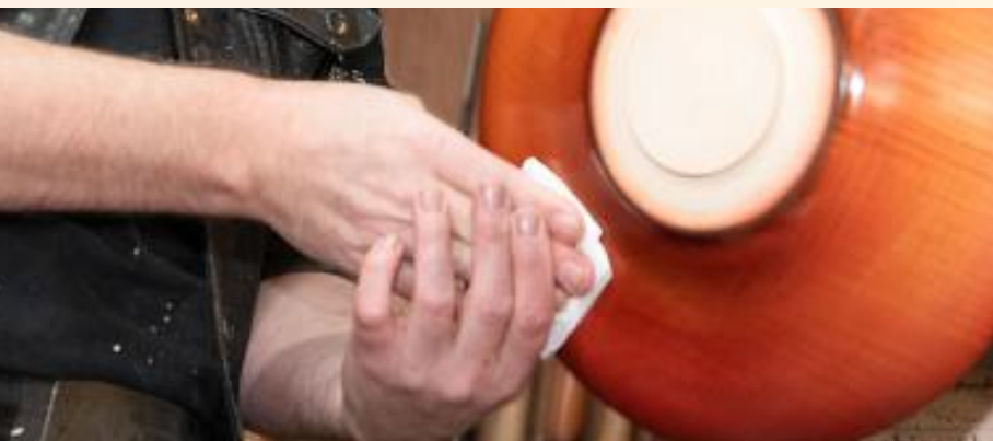
The Importance of Great Finishing